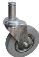
5" Industrial Caster Without Brakes