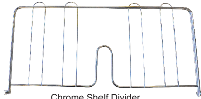
Chrome Shelf Divider