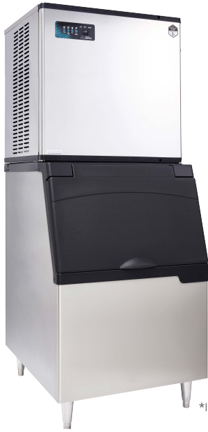
ICETRO IM-0550 ice machine on a IB-044 bin