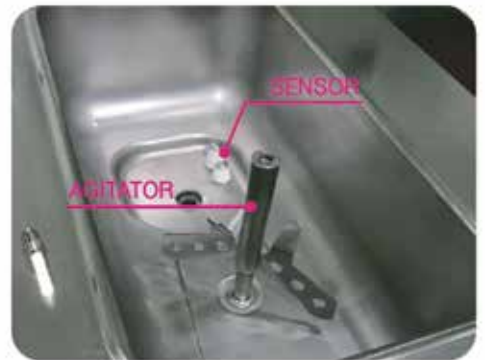
Agitator Mix out & mix low sensors