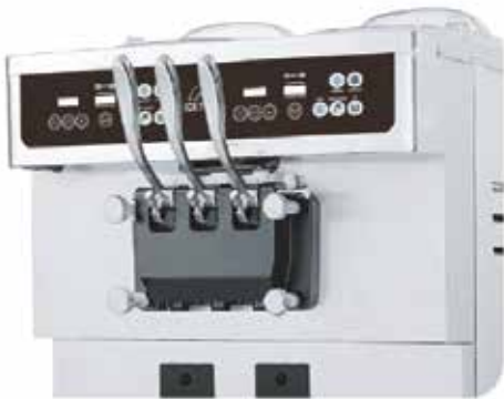
Easy to access control system on the front touch panel