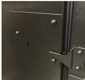
Integrated Health Lock